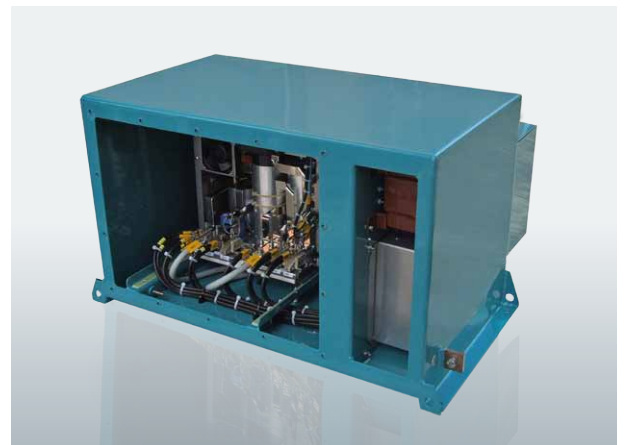
PCS Rail CU 25-110 underfloor application